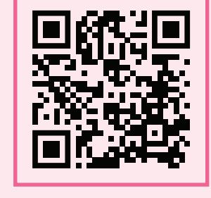
Scan to see the workflow in video