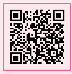
Scan here to learn more about cellenONE single cell dispenser